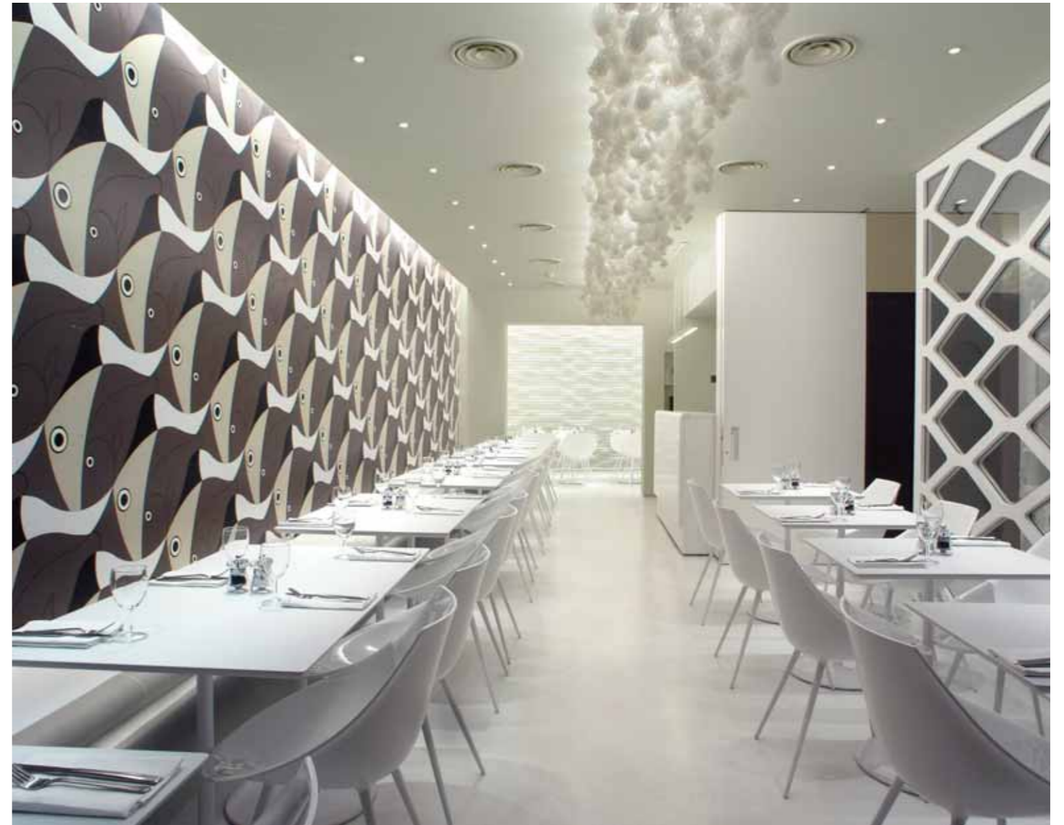
1 3D modelling of the ripple wall 2 View through the restaurant showing glazed partition, jigsaw wall and ripple wall